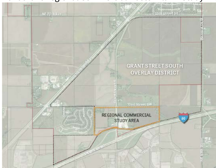
Bondurant Regional Commercial Master Plan – Study Area Boundaries Map

https://www.dropbox.com/s/mmb4nu65nhngiqv/18003%20Design%20Guidelines%20Booklet%2020-03-09.pdf?dl=0