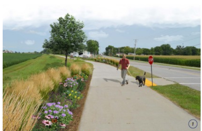
Trail landscaping using pollinator friendly native species, looking northeast from existing trail along 2nd St. NE

This project is an ongoing project that will be maintained by the City.