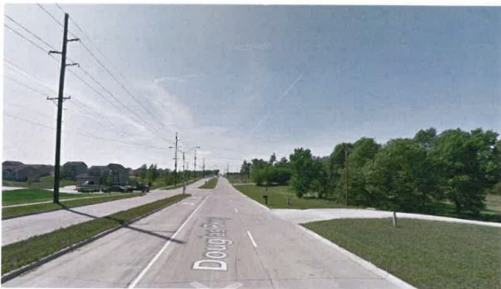
Metro Area 161 kV Line Examples